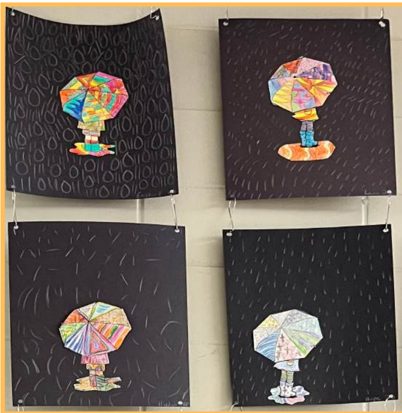
Elements & Principles of Art Project

In art, “balance” refers to the distribution of visual weight across a composition, ensuring that all elements appear evenly distributed and creating a sense of stability and harmony within the artwork, where no single element overpowers the others; it can be achieved through symmetrical or asymmetrical arrangements