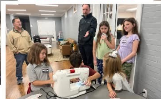
SEWING... & MORE!